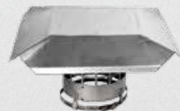
HOSE CLAMP SQUARE CAP