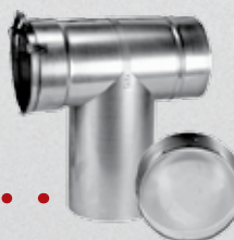
HOSE CLAMP TEE & END CAP