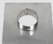
HOSE CLAMP TOP PLATE