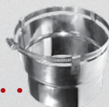
WOOD STOVE ADAPTER