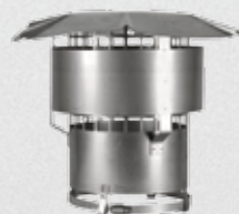
HOSE CLAMP ROUND CAP